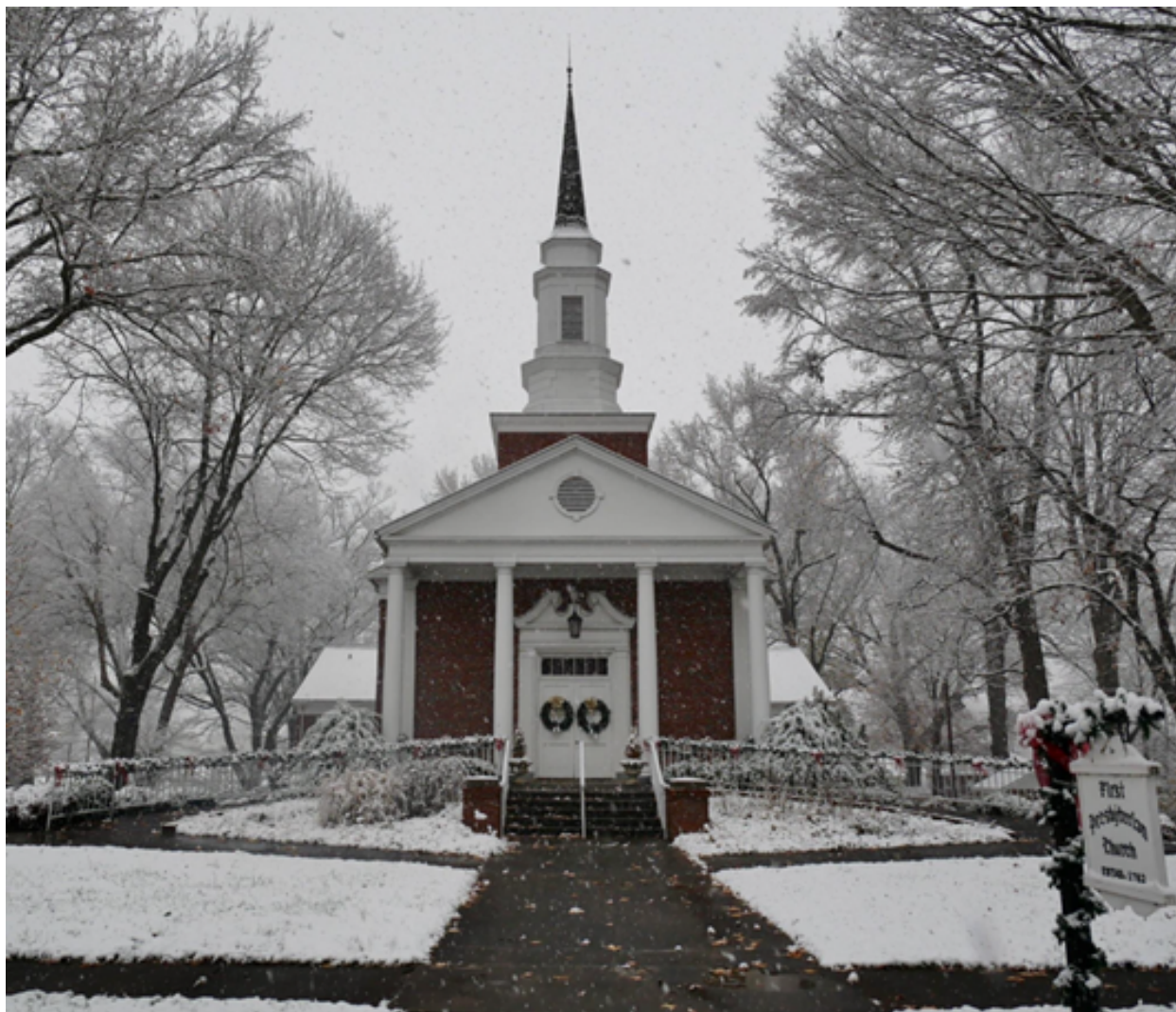
First Presbyterian Church in Elizabethton