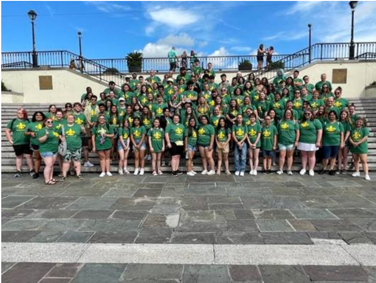
This a group photo taken opposite Jackson Square at the French Market.

This cultural enrichment trip marked the 49th year Tusculum's Upward Bound programs have offered a Summer Academy.