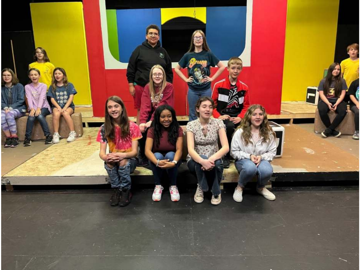
Cast members rehearse a scene in “Schoolhouse Rock Live! Jr.”