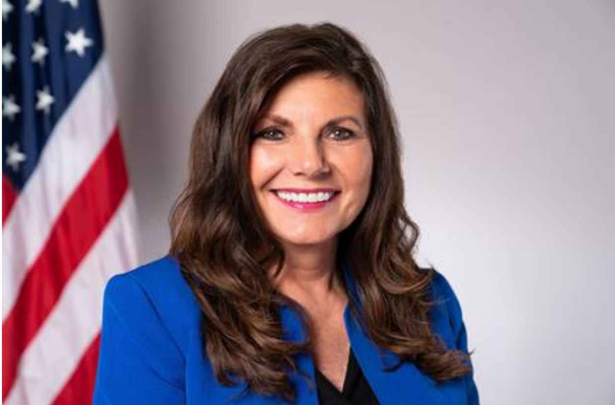
Congresswoman Diana Harshbarger

Harshbarger has served in Congress since 2021.