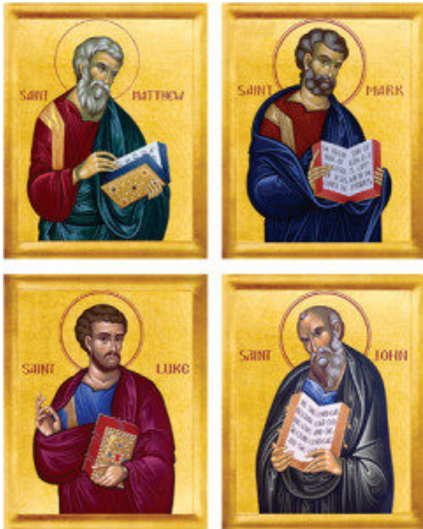
Image from First Baptist Church of Asheville, N.C., of the gospel writers