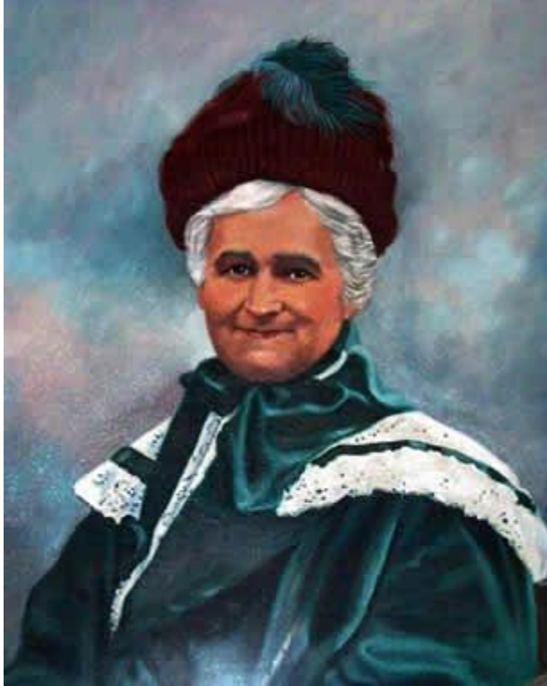
Nettie Fowler McCormick