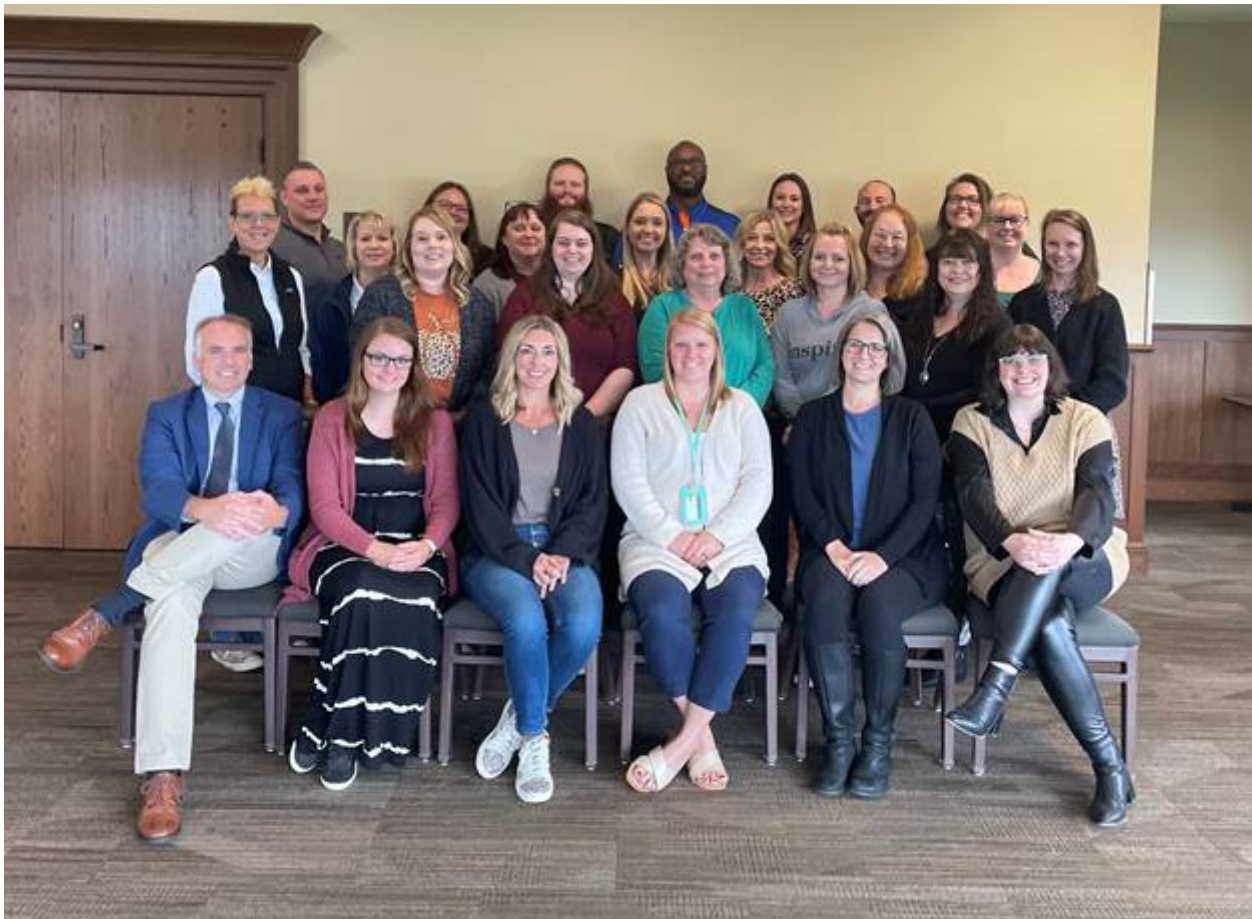
TRIO staff members gathered for a photo in September.

You can learn more about the Tusculum TRIO programs in this news release .