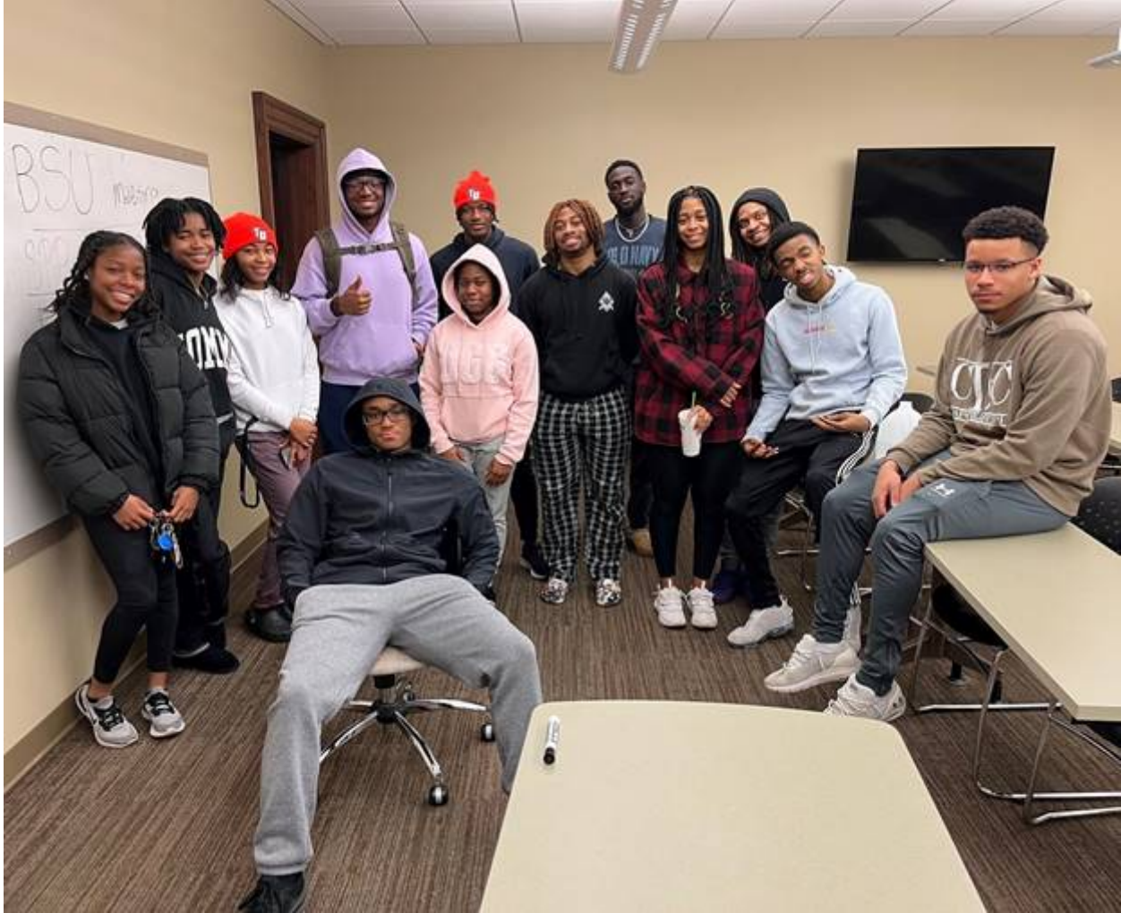
Black Student Union members gather after their meeting Sunday.