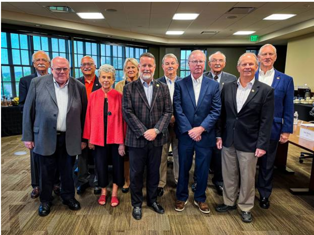
The Board of Trustees posed for a photo Thursday during its meeting Thursday.