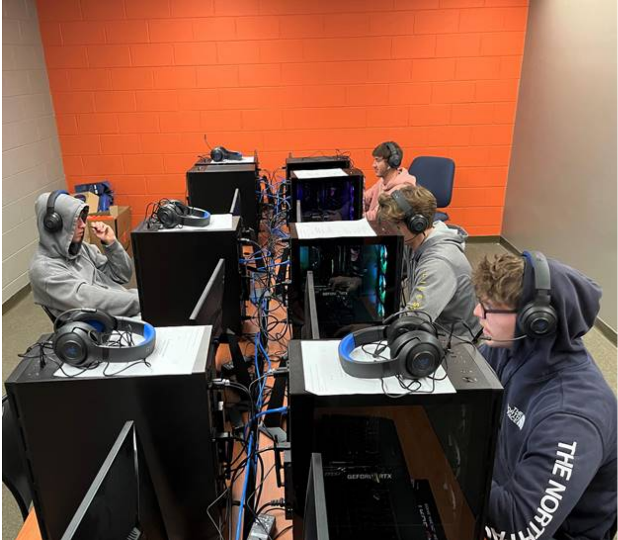
Students play in the e-sports lab.