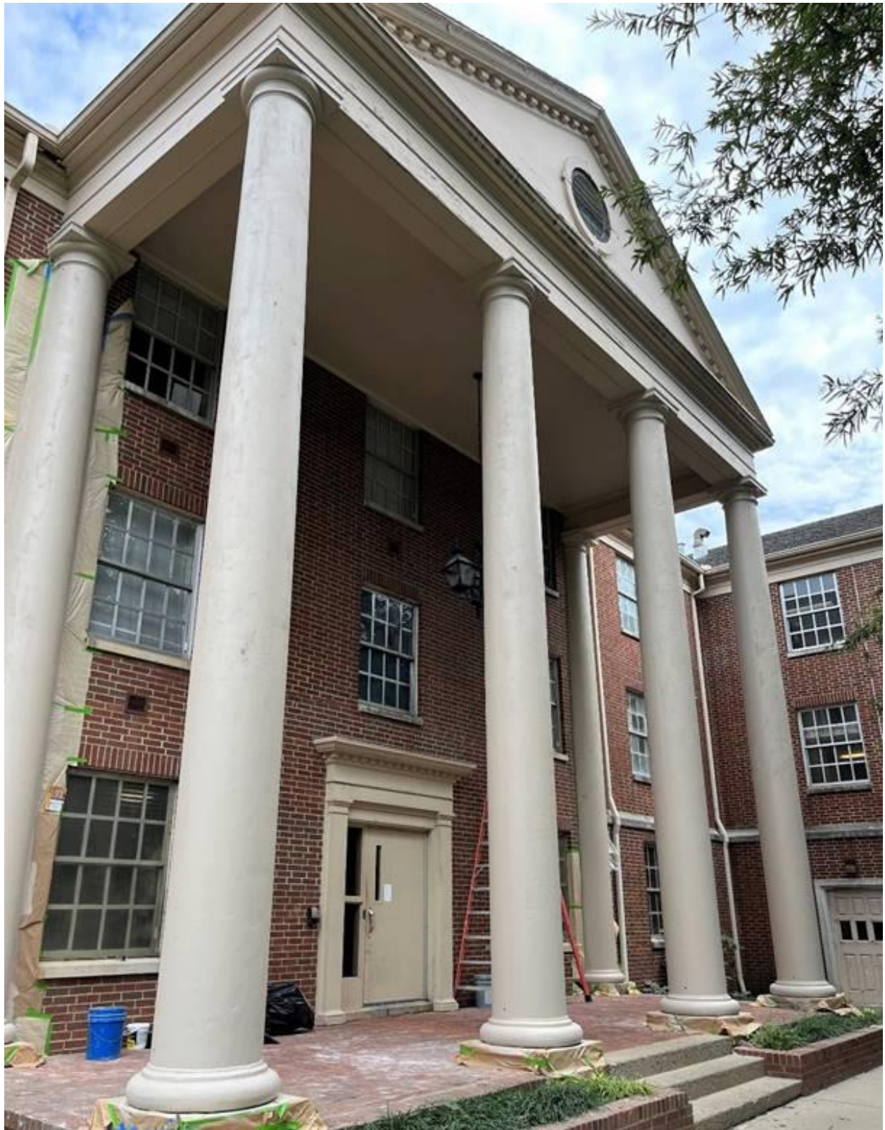
The pillars at Katherine Hall are receiving the updated look.