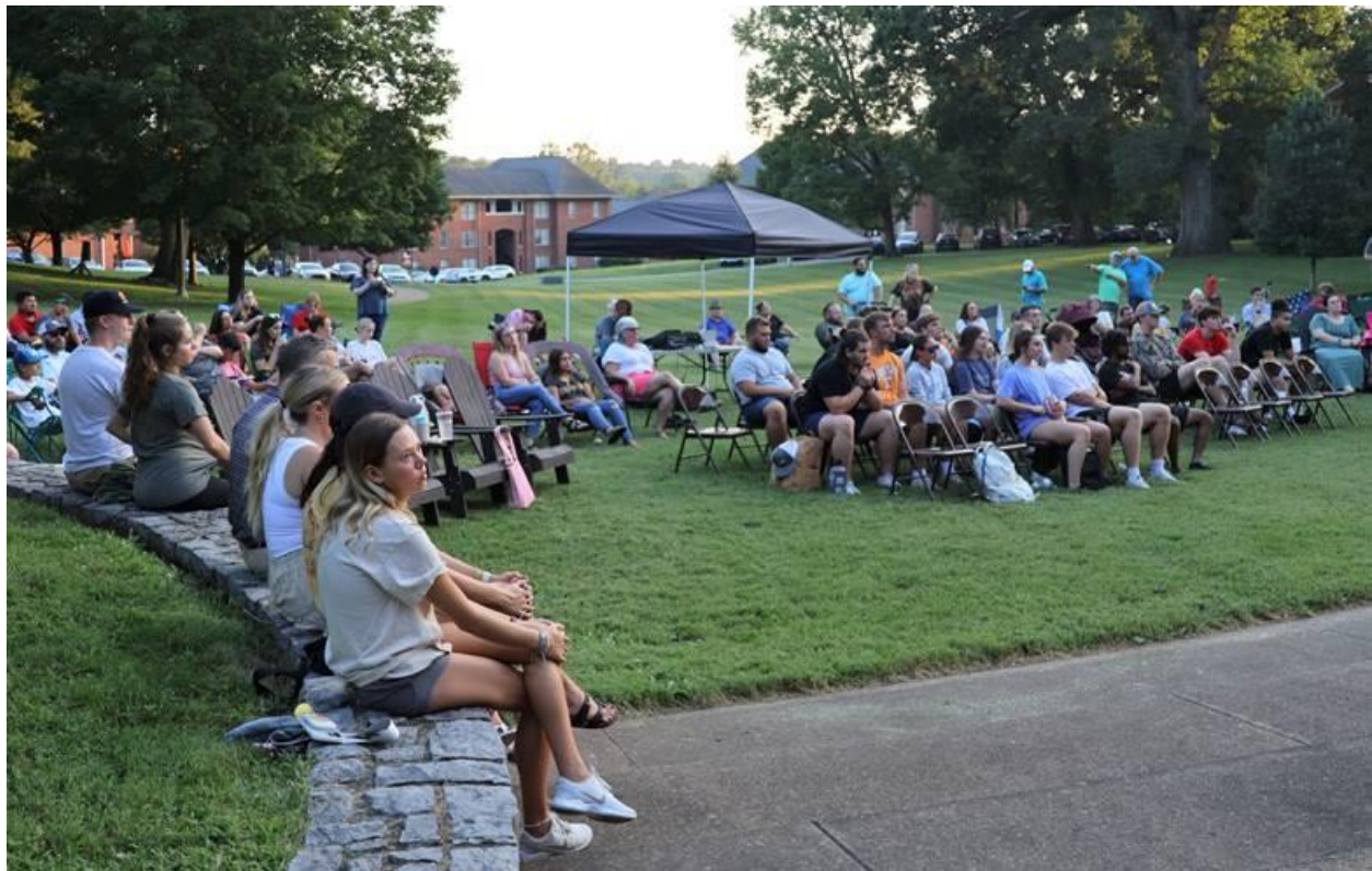
Students and the community came together to celebrate Night of Worship in the Library Bowl on Wednesday, Aug. 23.